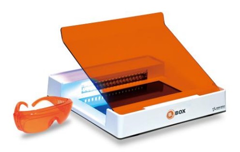
B-BOX<sup>™</sup> Blue Light LED epi-illuminator