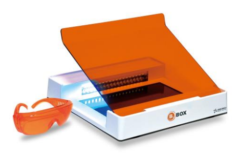
B-BOX<sup>™</sup> Blue Light LED epi-illuminator